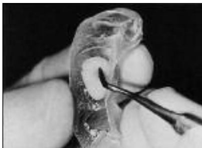
Select the desired shade of TRIAD Provisional Material and place it into the clear matrix.