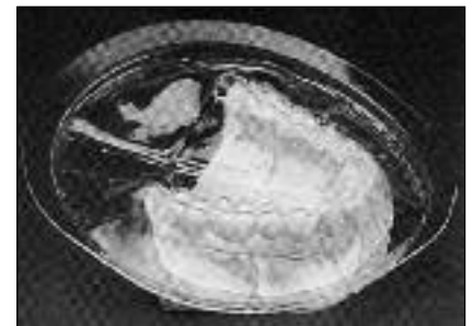
Make a preoperative cast with a clear matrix.*