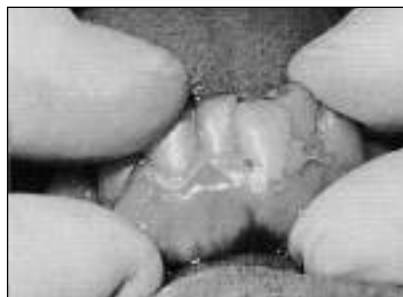
Press the filled matrix into place over the lubricated tooth preparation(s) using adjacent areas as a guide.*