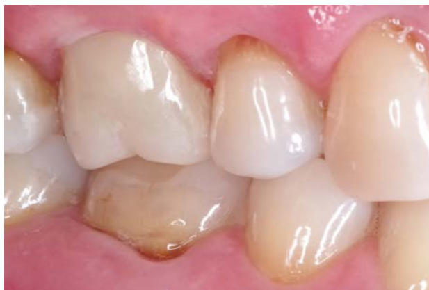
This blended nature works extremely well on the buccal surfaces where the patient would likely be evaluating the esthetics.