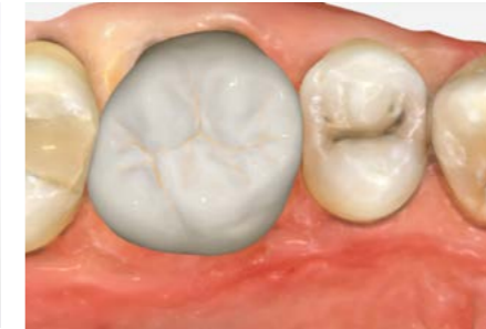
After the margin has been marked and approved, the proposal is completed. The CEREC software analyzes adjacent teeth to find a very good anatomical shape that fits the patient. This is the biogeneric calculation, and it greatly reduces the amount of time of the design process.