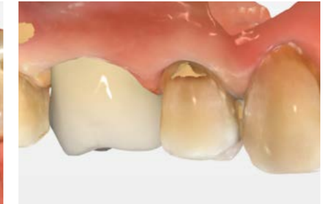
Aligning cusp tips and the flow of the occlusal table is totally customizable by the user for which a true custom restoration is produced for the patient.