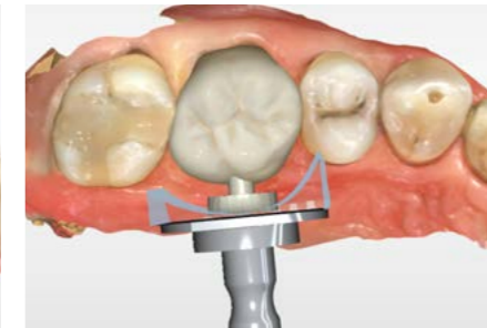
The milling paths are calculated, and the proposal is displayed how it will be milled. This is customizable as well.