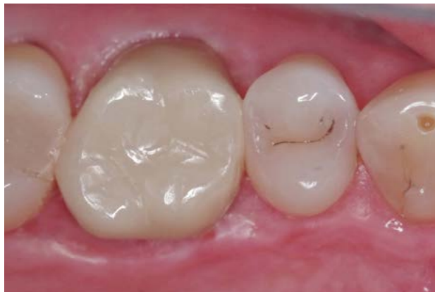
The manufactured restoration is ready for the patient and is cemented. The advancing technologies in zirconias are bringing out better esthetics with every generation. Being a blended translucent ceramic, the material is getting closer and closer to the optical characteristics of tooth structure.